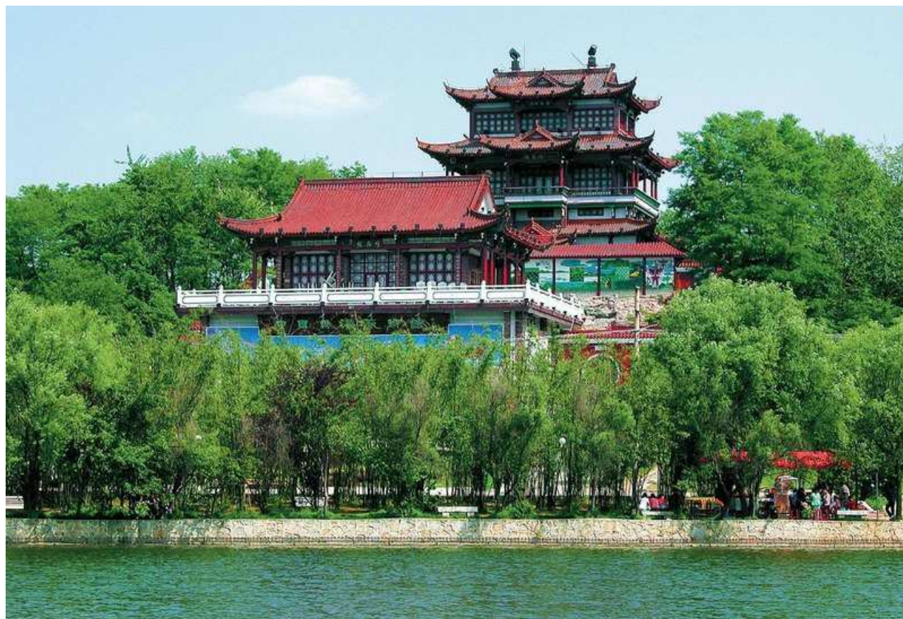
The China Kite Art Museum is located in Baiyun District, Guiyang City.

In the late 1980s, the government began to pay attention to the development of competitive kite flying, and in 1989, it organized the first Guiyang Baiyun Kite Festival.